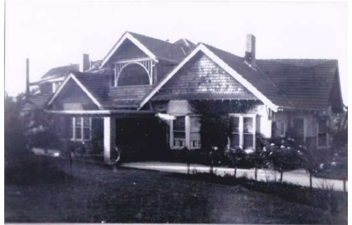
5 Studley Avenue, Kew

On each gate was a copper plate marked 'Merriwa' and these were kept polished with 'Brasso' by Mr. Laing. The garden was laid out with many flower beds and borders and lines of standard roses. Every Saturday morning Mr. Laing would put on the laundry bench a baby's bath full of cut flowers, all tied with raffia, for Mrs. Hume to arrange. There were trees, shrubs, fruit trees, a large dahlia bed, palm trees and formally planted flowers in banks also a vegetable garden with rows of mint, parsley, thyme, gooseberries. Dominating the garden was a magnificent English Elm tree and this was the tree always used as 'home' in the endless games of 'hidey' and other games.