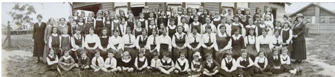
WOODBURY COLLEGE, 1919