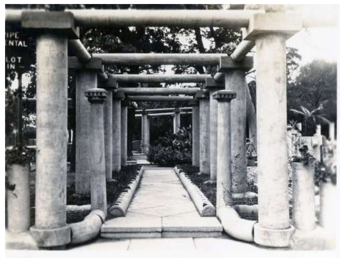
Hume Experimental Garden Plot 1920s