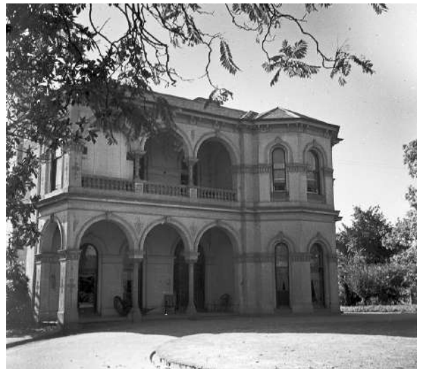
East (Princess Street) Elevation - Ruskin Hall, 81 Princess Street

In 1934 Jones was elected to the Legislative Council with the support of the United Australia Party as member for the South-Western Province. He resigned from the Argyle Government in March 1935, and retired from the Legislative Council in 1940 to rule over a family empire of real estate and grazing properties.