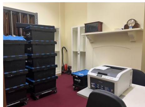
NINE OF THE SEVENTY CRATES USED IN THE MOVE