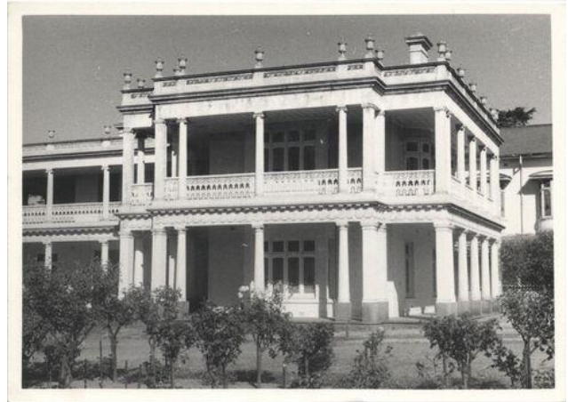
STUDLEY HOUSE