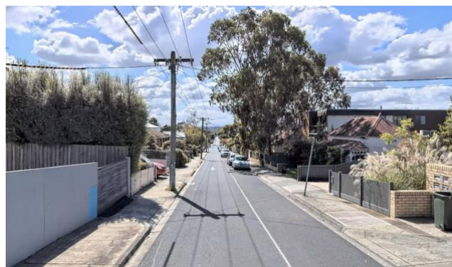
COBDEN STREET LOOKING NORTH