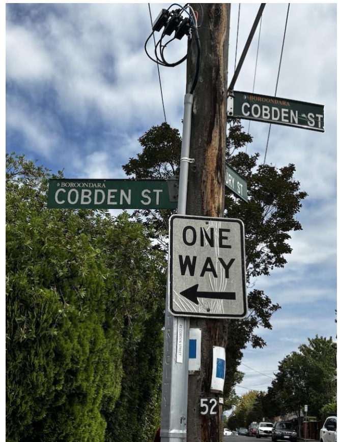
COBDEN STREET SIGN

Some things stay the same. At the intersection of Eglinton with Cobden and Tennyson Streets, the original cream and red wall with its MILK BAR notice remains.