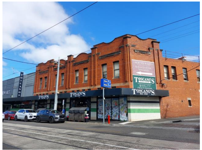
TOSCANOS IN HIGH STREET, KEW