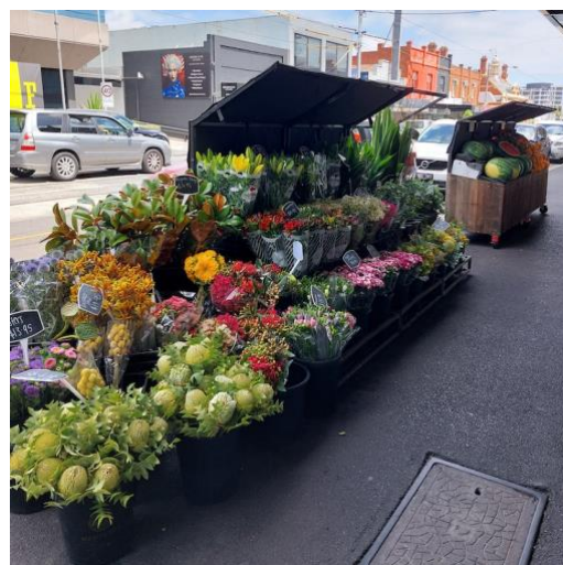
FLOWERS FOR SALE AT TOSCANO'S IN HIGH STREET Desley Reid, photographer, 2026

The changes witnessed by Joe in the years since he began managing the store have mostly been positive. He applauds the practice of growers using portable cool rooms when picking their crops. Produce is transported to market in optimum conditions and then transferred to the cool room at Toscano's by refrigerated truck.