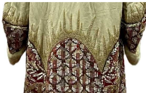
BEADING ON THE REVERSE OF THE COAT

One of clues that made dating more certain was the design, particularly that of the gold beading, which extends into the undecorated fabric of the coat above the sequined panels. This is particularly apparent on the reverse, where the beading can be seen to represent the sun's rays.