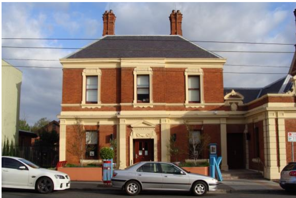
FORMER POLICE STATION, 2012

We gratefully acknowledge the support of the City of Boroondara in funding the move and in providing us with the former Police Station as our new headquarters.