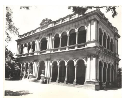
ROSS HOUSE [formerly Charleville] 292 COTHAM ROAD

Upon returning to Melbourne in 1989 he added more businesses to his stable of assets – a BMW franchise in South Yarra and Silverstone Jaguar in Doncaster, Toyota and Honda dealerships in Penrith NSW, Toyota and Ford trucks in Adelaide and Brisbane. Back in the United States, he was also a big shareholder in a $12-million-a-year electronics manufacturing business and owned industrial real estate.