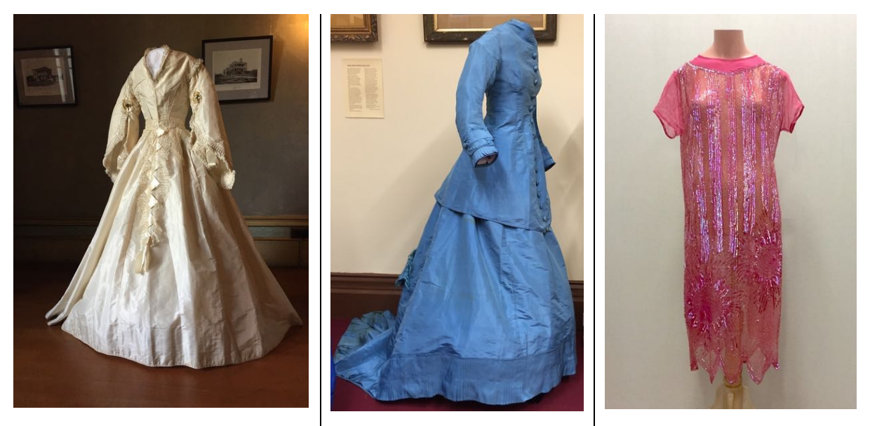
A two-piece white silk wedding dress dated c.1869, which has wide pagoda sleeves; a blue silk jacket and skirt from c. 1868-72; a bright print sequinned Flapper dress from the 1920s