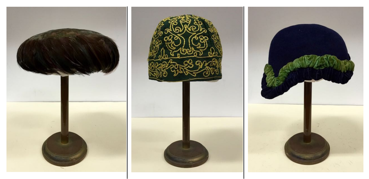
The c.1960s circular French hat covered in iridescent feathers; a gentleman's smokers (loungers) cap from the 1870s Victorian gold fields; a 1920s navy blue felt cloche hat, with ruched bands of navy and green velvet around the edge