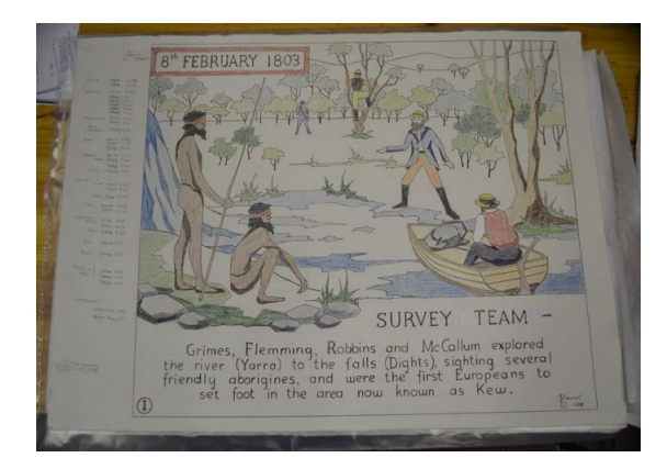
A Joy Stewart watercolour sketches; Stewart's coloured drawing used as a template for the bicentenary tapestry project