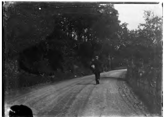
Man walking along a road (c1910) – Series: 'Yallambie' views, now Preshill School, Barkers Road, Kew.

Was the termination of Barkers Road at Burke Road the price it had to pay for the privilege of conforming to the expanding requirements of Melbourne?