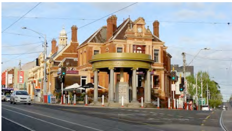
World War I Memorial, Kew Junction

A meeting of members of the Boroondara Historical Societies Association, together with a representative from The Friends of Boroondara (Kew) Cemetery, held an inaugural meeting in October 2012 at the Surrey Hills Neighbourhood Centre to discuss 'Gallipoli and Beyond: April 2015'.