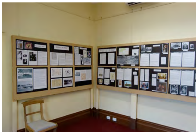
Exhibition at the Court House