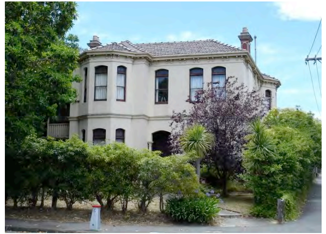
65 Wellington Street, Kew

"I am, as you know, a reasonably bigoted Kew citizen, proud of the history of the City and delighted with its constant development. There are, no doubt, those who think that Kew is a quiet corner of Greater Melbourne, and that this takes it out of the main stream of events. There could be no greater error. A quiet corner we may be, but the quietness is one which has nourished thoughtful people, good citizens and great schools. There is a charm about Kew which nothing can take away from it."