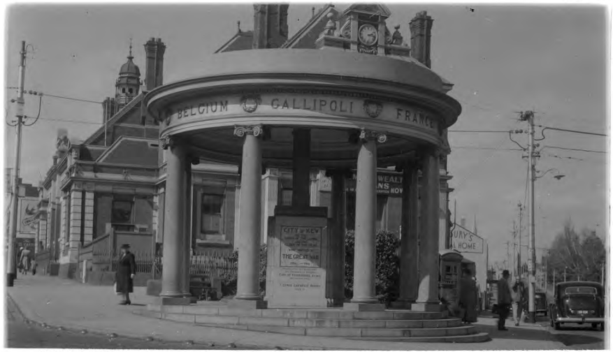
War Memorial, Kew (Postcard), (c1920-54)