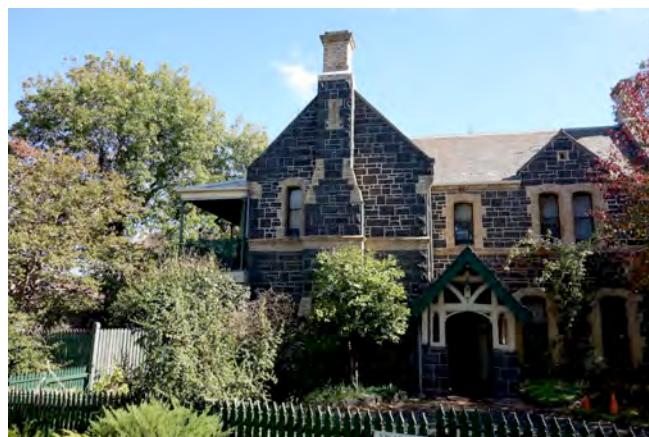
Vicarage, Holy Trinity Church, Kew