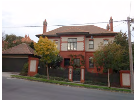
10 Howard Street, Kew