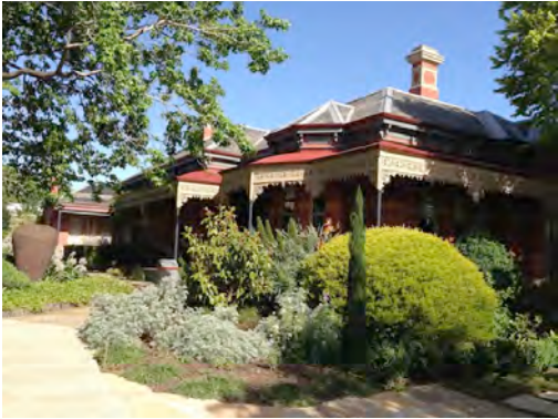
56 Charles Street, Kew