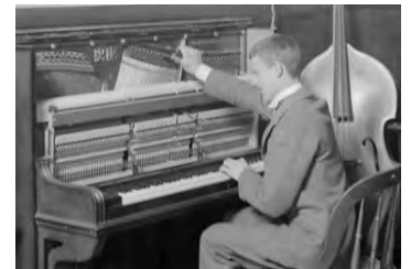
Detail from [Blind man tuning a piano] (1912)