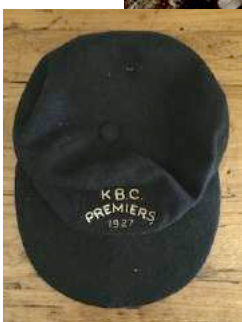
Left. Kew Baseball Club premiers cap, 1927