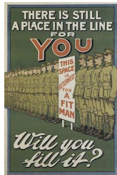
Above: Recruitment poster, 1916.