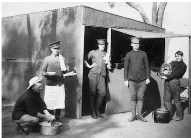
Broadmeadows, Victoria 1916. An army cookhouse and staff.

When men enlisted, there was a clear process followed. Firstly, they were given a medical examination by the local medical officer, who provided a 'Certificate of Medical Fitness'. Then they went to the central examination depot for another medical check. Thirdly, they went to the Sturt Street Receiving Depot. Finally, they went onto training camps, such as that at Broadmeadows.