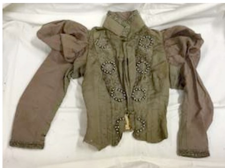
Victorian dress (part). Netta Fuller collection

An exhibition of costumes, personal accessories, photographs and ephemera that illustrates the fashions adopted by women during the period 1850 to 1901. Items include rarely seen costumes and objects from our collection that are augmented by pieces loaned by members and friends of the Society. The exhibition is funded through a Strengthening Communities Grant provided by the City of Boroondara.